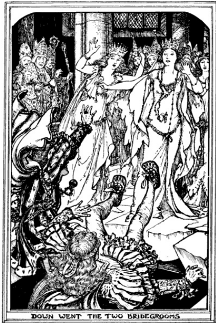
DOWN WENT THE TWO BRIDGROOMS

So the king said they should put off the marriage. 'For,' says he, 'I see there is no use in thinking of it till the youngest gets her three crowns, and is married with the others. I'll give my youngest daughter for a wife to whoever brings three crowns to me like the others; and if he doesn't care to be married, some other one will, and I'll make his fortune.'