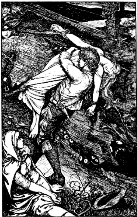
HOW JOHN GOT HIS WIFE BACK FROM THE FAIRIES