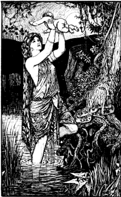
MY BABY, MY BABY ! ”

'The sun is hot,' said the snake, 'and you have walked far. Take your baby and bathe in that cool place where the boughs of the tree stretch far over the water.'