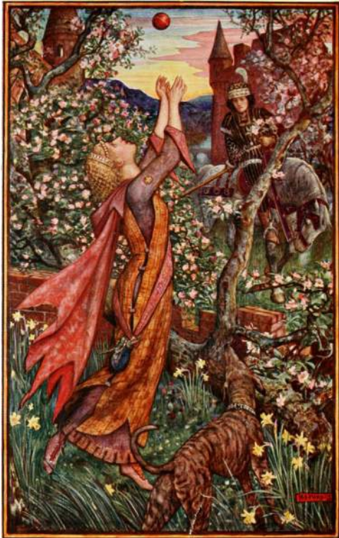
"How the King found the girl playing at ball in the orchard."