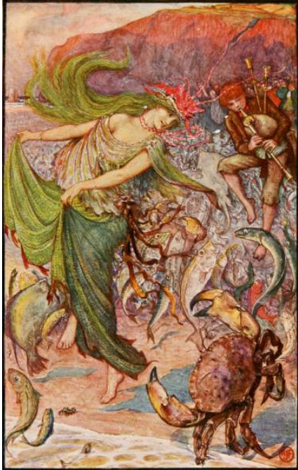
The Sea-lady allures Maurice into the Sea.

When Maurice's mother saw him with that unnatural thing in the form of a green-haired lady as his guide, and he and she dancing down together so lovingly to the water's edge, through the thick of the fishes, she called out after him to stop and come back. 'Oh, then,' says she,