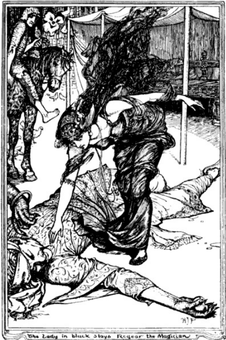
The Lady in black slays Regear the Magician

'The flower that laughs opens all doors and lightens all darkness,' said the lady; and as she spoke, they reached the further bank, and advanced towards the castle.