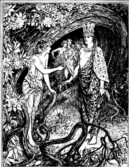
HOW THE IRON TREE BOWED DOWN AND THE GIRL GAVE OF ITS LEAVES AND FLOWERS TO THE KING. ~ ~ ~ ~ ~

Soon the man returned, with the girl walking behind him. And as soon as she reached the tree it bowed itself to the earth before her, and she stretched out her hand and picked some of its leaves and flowers and gave them to the king.