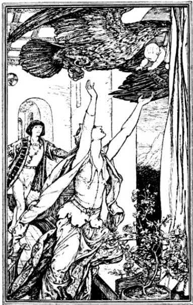
The Princess loses her first Baby .

In time she told them all that happened to her, and they didn't know what to advise her to do. She was as fond of her husband as ever, and said she was sure that he couldn't help letting the children go; but still she was afraid beyond the world to have another child torn from her. Well, the mother and sisters consulted a wise woman that used to bring eggs to the castle, for they had great faith in her wisdom. She said the only plan was to secure the bear's skin that the prince was