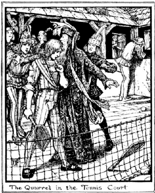
The Quarrel in the Tennis Court

On hearing this the king walked to the window and stood for a few minutes with his back to the room, where the company of young men remained silent. Then he came back, his face white and stern.