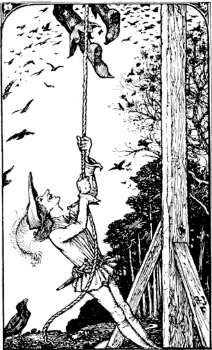
HOW THE BLACK ROGUE WAS TRICKED