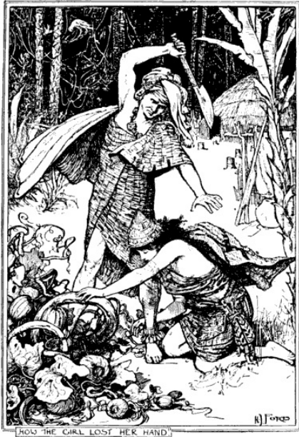
HOW THE GIRL LOST HER HAND

When she woke up on the seventh morning she saw from her perch smoke coming up from a little town on the edge of the forest. The sight of the huts made her feel more lonely and helpless than before. She longed desperately for a draught of milk from a gourd, for there were no streams in that part, and she was very thirsty, but how was she to earn anything with only one hand? And at this thought her courage failed, and she began to cry bitterly.