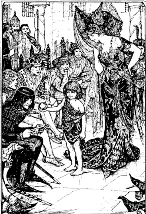
THE CHILD FINDS OUT THE TRUTH