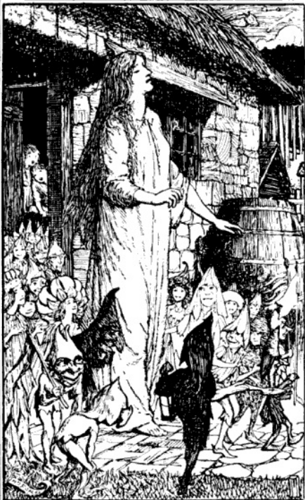
The Fairies go off with the Farmer's Wife