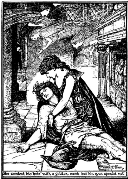
She combed his hair with a golden comb but his eyes opened not

Next day he set out for the church, but the old woman of the cottage had gone before him, and had stuck an enchanted stick called 'the spike of hurt' in a crack of the door, so that he would brush against it as he stepped across the threshold. Suddenly he felt so sleepy that he could not stand up, and throwing himself on the ground he sank into a deep slumber, not knowing that the dark lad was watching him. Nothing could waken him, not even the sound of sweetest music, nor the touch of a lady who bent over him. A sad look came on her face, as she saw it was no use, and at last she gave it up, and lifting his arm, wrote her name across his side—'the daughter of the king of the