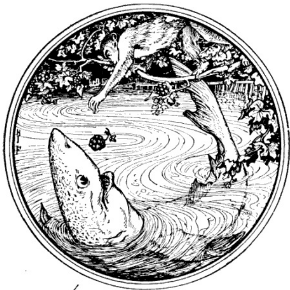
The Monkey feeds the SHARK

hit the shark's mouth as he supposed, even when the creature had turned on his back, and the first kuyu only struck one of his teeth and rolled into the water. However, the second time the monkey had better luck, and the fruit fell right in.