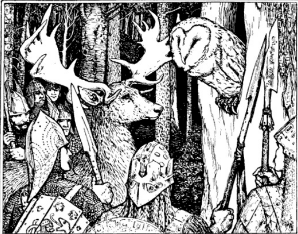
The Stag - of Redynvire brings the Seven Companions to the Owl of - Cwm Cawlwyd

'When I first came hither,' said the eagle, 'there was a rock here, and every evening I pecked at the stars from the top of it. Now, behold, it is not even a span high! But only once have I heard of the man you name, and that was when I went in search of food as far as Llyn Llyw. I swooped down upon a salmon, and struck my claws into him, but he drew me down under water till scarcely could I escape from him. Then I summoned all my kindred to destroy him, but he made peace with me, and I took fifty fish spears from his back. Unless he may know something of the man whom you seek I cannot tell who may. But I will guide you to the place where he is.'