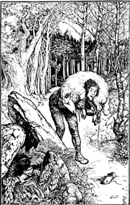
THE SHOE IN THE ROAD