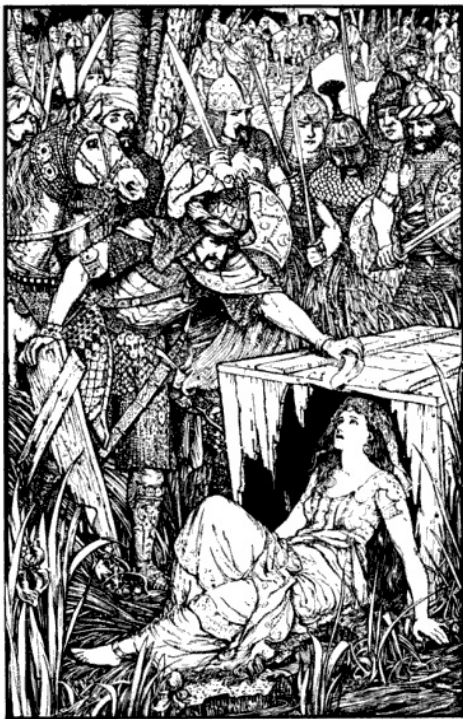
The Princess Released from the Box