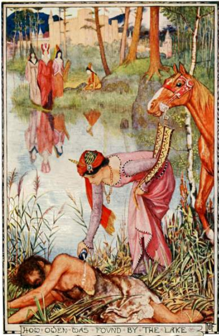
HOW OWEN WAS FOUND BY THE LAKE

So they rode to the castle of the countess of the fountain, and spent three months in resting and feasting. And when it was time for them to depart Arthur besought the countess that she would allow Owen to go with him to Britain for the space of three months. With a sore heart she granted permission, and so content was Owen to be once more